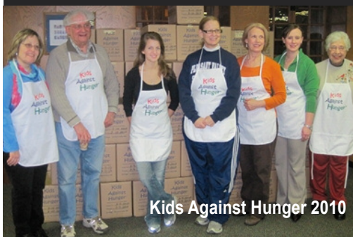
Kids Against Hunger 2010