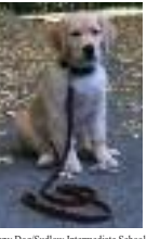
Therapy Dog Sudlow Intermediate School