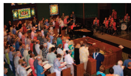
From the Bix Sunday archives of 2005