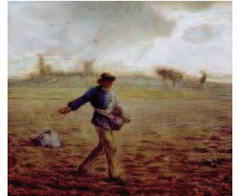
wikimedia.org/wikipedia/commons/f/f6/Jean-Fran%27ois Millet-The Sower-Walters_37905.jpg