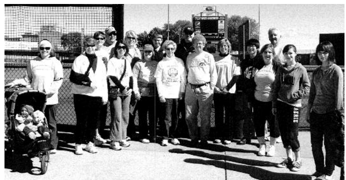
CROP walkers representing First Pres. in 2010.