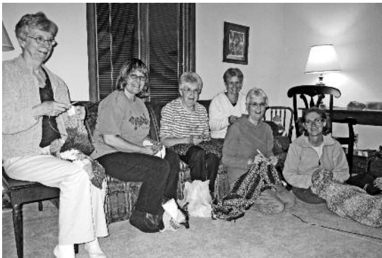
Prayer Shawl Ministry (PSST - Prayer Shawl Second Tuesday)