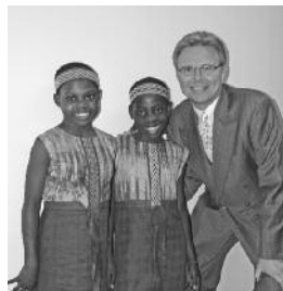
African Children's Choir

Performing Arts Series presentation of Quartet San Francisco , co-sponsored by Quad City Arts.