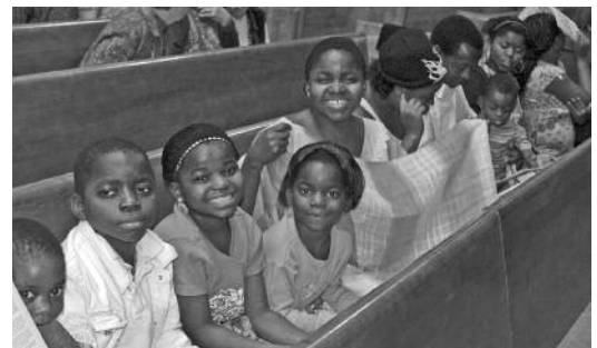
Congolese Family at a Sunday morning worship service at FPC.