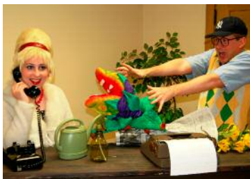
Little Shop of Horrors

Performing Arts Series presentation of the Broadway musical, Little Shop of Horrors .