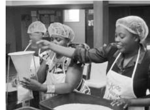
A Kids Against Hunger team