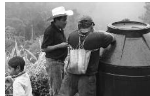
Guatemala Mission - mountain rainwater retention system

Meal Service of Scott County, Inc., is a non-profit organization that does not receive any federal, state, county, or United Way funds. It relies on donations, memorials, and grants from individuals and organizations to provide this valuable community service.