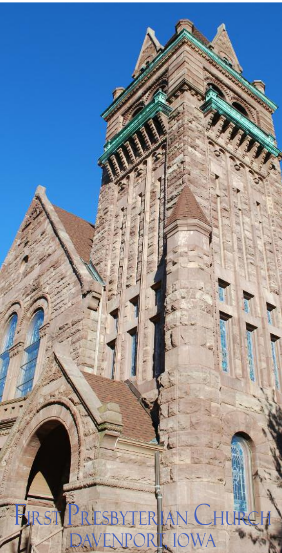
FIRST PRESBYTERIAN CHURCH DAVENPORT IOWA