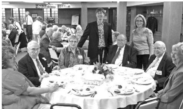
Homecoming 2010 luncheon