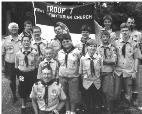
Troop 7: Summer Camp at Camp Loud Thunder

Sponsored mission of First Presbyterian Church