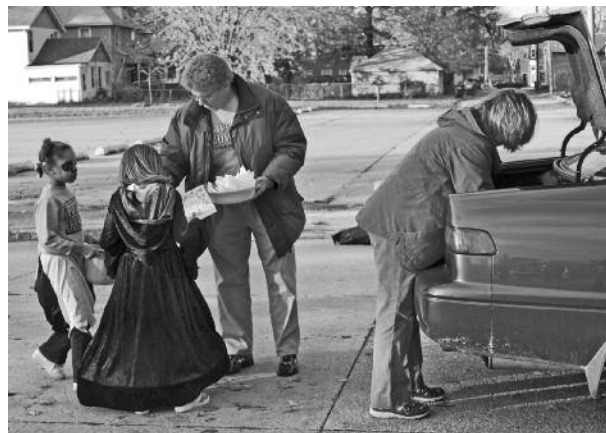
The Deacon sponsored Trunk or Treat and children of the Boys and Girls Club.