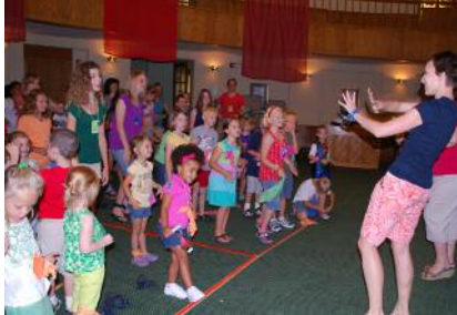
Vacation Bible Camp song & dance!