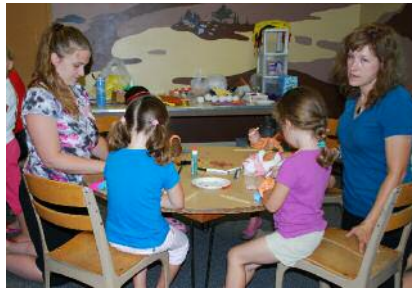
Vacation Bible Camp lesson & craft time