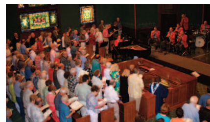
From the Bix Sunday archives of 2005