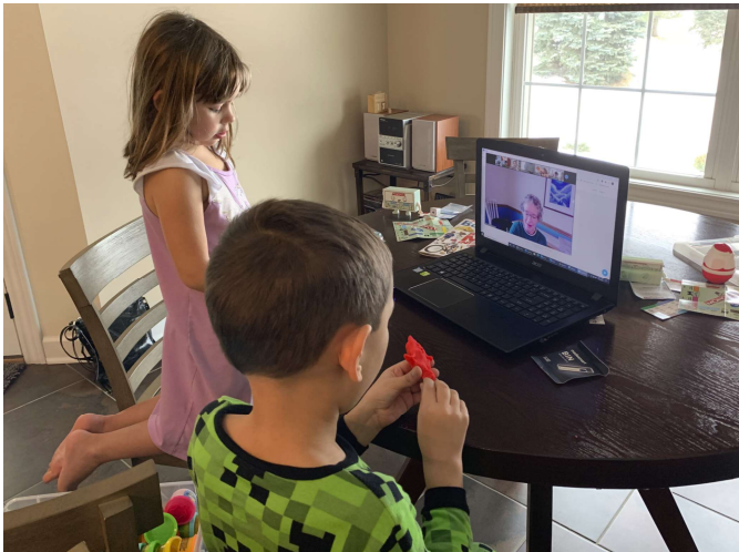
Zoom Sunday School Fun!