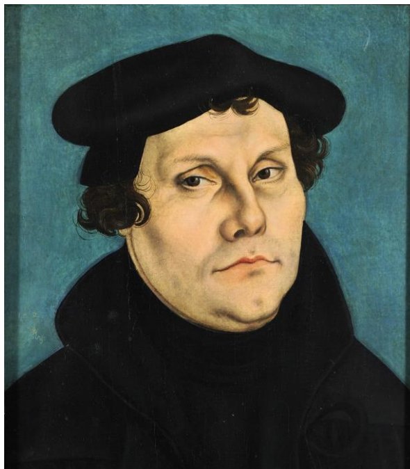
Lucas Cranach the Elder (1472-1553) – Portrait of Martin Luther (Coburg Fortress, Germany)