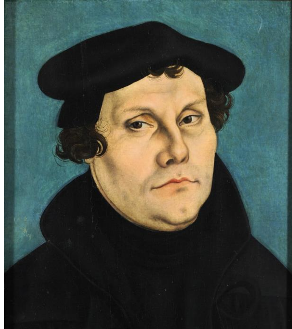
Lucas Cranach the Elder (1472-1553) – Portrait of Martin Luther (Coburg Fortress, Germany)