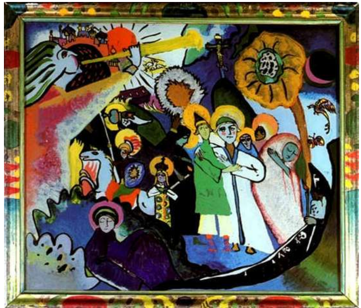
Wassily Kandinsky (1866-1944) – All Saints II, reverse (Lenbachhaus Gallery, Munich)

"Give, and it will be given to you. A good measure, pressed down, shaken together and running over, will be poured into your lap. For the measure you give will be measured to you." -Luke 6:38