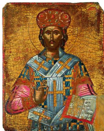
Greek Orthodox Icon, "Christ the King of Kings" (unknown artist, ca. 1600) Vanderbilt University Collection – "Art in the Christian Tradition"

"Jesus answered, 'My kingdom is not of this world .... Everyone who belongs to the truth listens to my voice.'" John 18: 36, 37