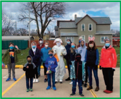
Easter Egg Dash

Kirkwood Choir is in recess until the fall. Have a wonderful summer! Look for information about coming choir activities in the Fall 2021 Broadcaster!