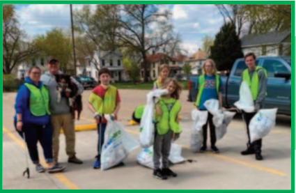
Earth Day Clean Up