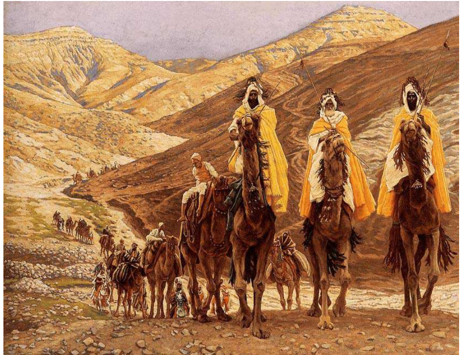
James Tissot (1836-1902), Journey of the Magi . Minneapolis Institute of Art

"... the Gentiles have become fellow heirs, members of the same body, and sharers in the promise in Christ Jesus through the gospel." -Eph. 3: 6