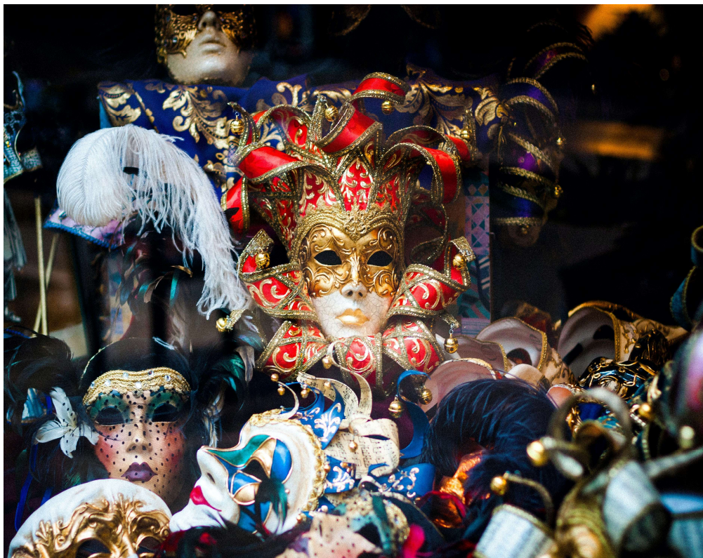
Carnival masks in Barcelona, Spain.

"Before I formed you in the womb I knew you, and before you were born, I consecrated you; I appointed you ...." -Jeremiah 1: 5