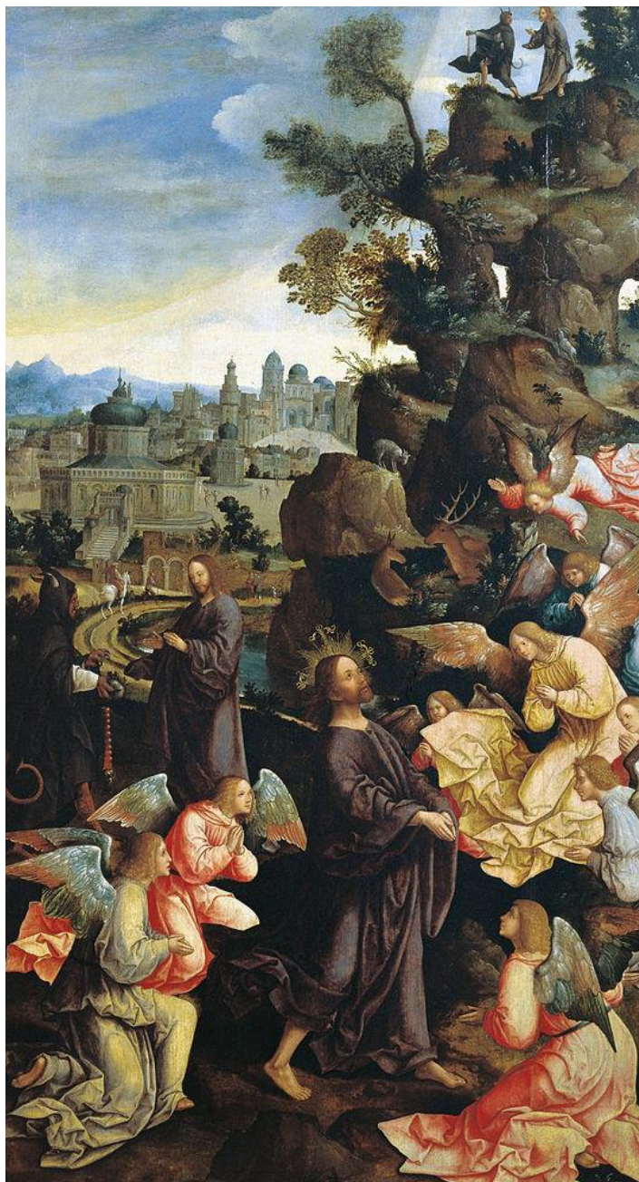
Jakob Cornelisz van Oostsanen (1472?-1553), "Temptation of Christ" (Suermondt Ludwig Museum | Aachen, Germany)