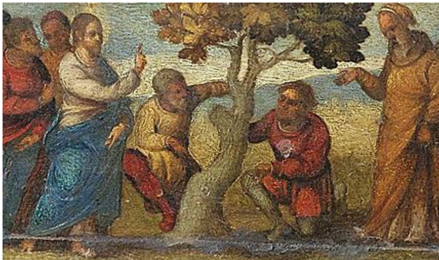
Lodovico Mazzolino (ca. 1480 – 1530), "Moses and the Tablets of the Law" (detail) Rijksmuseum, Amsterdam, 1525-1530