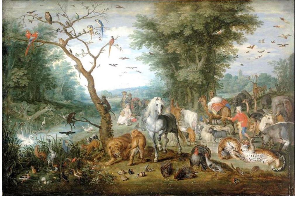
Jan Bruegel (1568-1625), "Paradise Landscape with Animals" (1613-1603) Museum of Fine Arts (Budapest)

First Presbyterian Church gratefully acknowledges the Indigenous Peoples on whose ancestral homelands we gather, as well as the diverse and vibrant Indigenous communities who make Iowa and Illinois their home today. The communities we serve through our ministries occupy the traditional homelands of the people of the Kiikaapoi, Myaamia, Očhéthi Šakówinj, Peoria, Sauk, and Meskwaki nations. We honor these and numerous Indigenous tribes who first made the banks of the Mississippi River a center for arts and commerce.