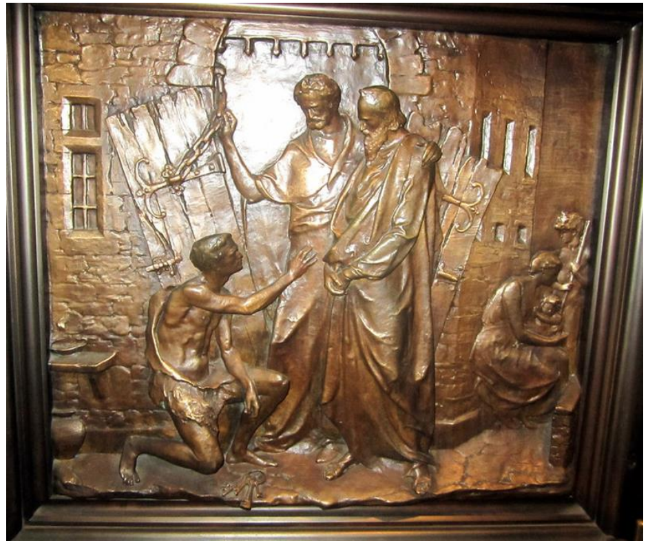
Richard Morris Hunt (1827-1895), "Jailer, Paul, Silas, and the Jailer's Family" | Bronze Door Metalwork, Trinity Church, New York City

First Presbyterian Church gratefully acknowledges the Indigenous Peoples on whose ancestral homelands we gather, as well as the diverse and vibrant Indigenous communities who make Iowa and Illinois their home today. The communities we serve through our ministries occupy the traditional homelands of the people of the Kiikaapoi, Myaamia, Ojibwe, Šakówinj, Peoria, Sauk, and Meskwaki nations. We honor these and numerous Indigenous tribes who first made the banks of the Mississippi River a center for arts and commerce.