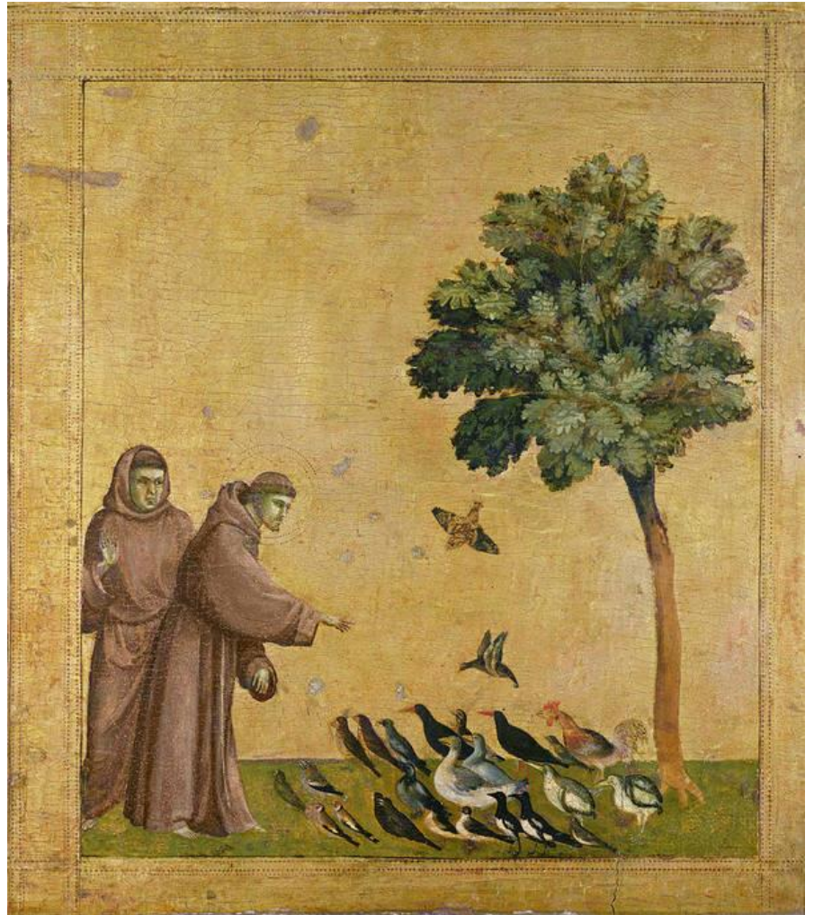
Giotto di Bondone (c. 1267-1337), "St. Francis Preaching to the Birds" (c. 1290) Musée du Louvre, Paris

First Presbyterian Church gratefully acknowledges the Indigenous Peoples on whose ancestral homelands we gather, as well as the diverse and vibrant Indigenous communities who make Iowa and Illinois their home today. The communities we serve through our ministries occupy the traditional homelands of the people of the Kiikaapoi, Myaamia, Ojéhéti Šakówinj, Peoria, Sauk, and Meskwaki nations. We honor these and numerous Indigenous tribes who first made the banks of the Mississippi River a center for arts and commerce.