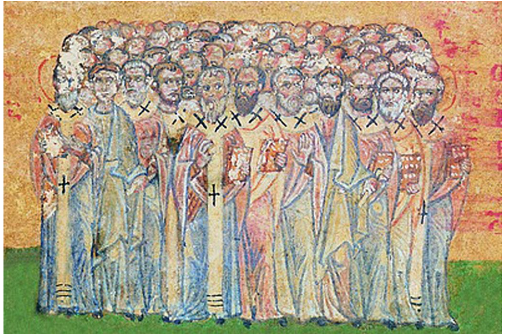
Anon., 15th-century Greek manuscript, "The Seventy Disciples"

First Presbyterian Church gratefully acknowledges the Indigenous Peoples on whose ancestral homelands we gather, as well as the diverse and vibrant Indigenous communities who make Iowa and Illinois their home today. The communities we serve through our ministries occupy the traditional homelands of the people of the Kiikaapoi, Myaamia, Ojibwe, Šakówinj, Peoria, Sauk, and Meskwaki nations. We honor these and numerous Indigenous tribes who first made the banks of the Mississippi River a center for arts and commerce.