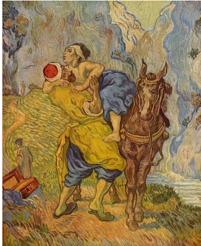
Vincent Van Gogh (1853-1890), "The Good Samaritan" (1890) Kröller-Müller Museum, (Otterlo, Netherlands)

First Presbyterian Church gratefully acknowledges the Indigenous Peoples on whose ancestral homelands we gather, as well as the diverse and vibrant Indigenous communities who make Iowa and Illinois their home today. The communities we serve through our ministries occupy the traditional homelands of the people of the Kiikaapoi, Myaamia, Očhéthi Šakówinj, Peoria, Sauk, and Meskwaki nations. We honor these and numerous Indigenous tribes who first made the banks of the Mississippi River a center for arts and commerce.