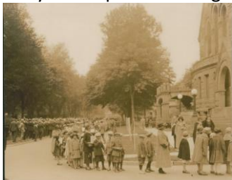
Procession festivities when the new sanctuary was dedicated in 1899.

The church has chosen the August 7 Bix Liturgy service to debut a short multi-media presentation telling the story of our priceless art glass windows skillfully created by Charles Lamb, a contemporary of Louis Tiffany.