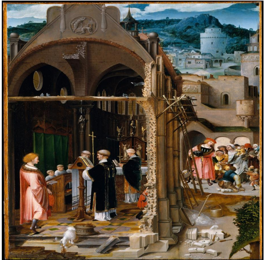
Anon. 16th-century Dutch, "A Sermon on Charity" (detail) Metropolitan Museum of Art, New York City

First Presbyterian Church gratefully acknowledges the Indigenous Peoples on whose ancestral homelands we gather, as well as the diverse and vibrant Indigenous communities who make Iowa and Illinois their home today. The communities we serve through our ministries occupy the traditional homelands of the people of the Kiikaapoi, Myaamia, Ojéhéti Šakówinj, Peoria, Sauk, and Meskwaki nations. We honor these and numerous Indigenous tribes who first made the banks of the Mississippi River a center for arts and commerce.