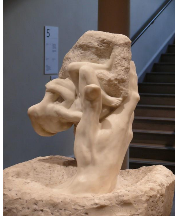
August Rodin (1840-1917), "Hand of God" (ca. 1898) Metropolitan Museum of Art, New York

First Presbyterian Church gratefully acknowledges the Indigenous Peoples on whose ancestral homelands we gather, as well as the diverse and vibrant Indigenous communities who make Iowa and Illinois their home today. The communities we serve through our ministries occupy the traditional homelands of the people of the Kiikaapoi, Myaamia, Ojibwe, Šakówinj, Peoria, Sauk, and Meskwaki nations. We honor these and numerous Indigenous tribes who first made the banks of the Mississippi River a center for arts and commerce.