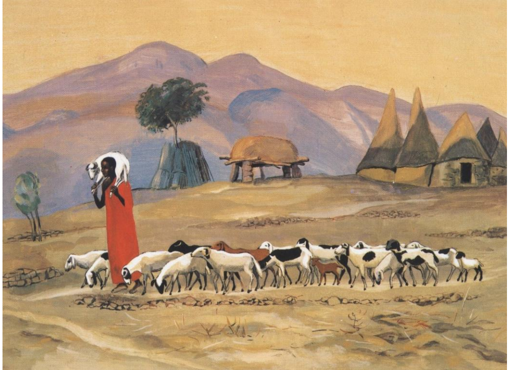
Jesus MAFA (1973), "The Good Shepherd"

First Presbyterian Church gratefully acknowledges the Indigenous Peoples on whose ancestral homelands we gather, as well as the diverse and vibrant Indigenous communities who make Iowa and Illinois their home today. The communities we serve through our ministries occupy the traditional homelands of the people of the Kiikaapoi, Myaamia, Ojibwe, Šakówinj, Peoria, Sauk, and Meskwaki nations. We honor these and numerous Indigenous tribes who first made the banks of the Mississippi River a center for arts and commerce.