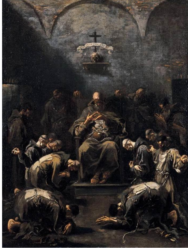
Alessandro Magnasco (1667-1749), "Prayer of the Penitent Monks" Private collection

First Presbyterian Church gratefully acknowledges the Indigenous Peoples on whose ancestral homelands we gather, as well as the diverse and vibrant Indigenous communities who make Iowa and Illinois their home today. The communities we serve through our ministries occupy the traditional homelands of the people of the Kiikaapoi, Myaamia, Ojéhéti Šakówinj, Peoria, Sauk, and Meskwaki nations. We honor these and numerous Indigenous tribes who first made the banks of the Mississippi River a center for arts and commerce.