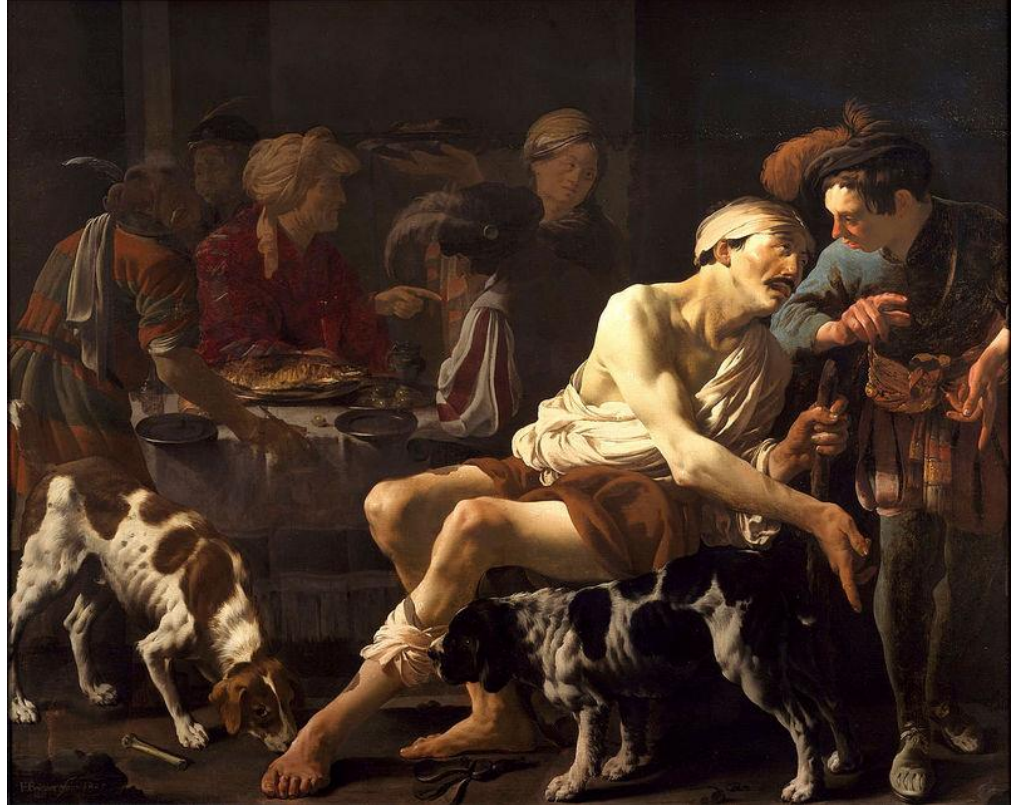
Hendrik Terbrugghen (ca. 1588-1629), "Rich Man and the Poor Lazarus" Centraal Museum (Utrecht, Netherlands)

First Presbyterian Church gratefully acknowledges the Indigenous Peoples on whose ancestral homelands we gather, as well as the diverse and vibrant Indigenous communities who make Iowa and Illinois their home today. The communities we serve through our ministries occupy the traditional homelands of the people of the Kiikaapoi, Myaamia, Ojibwe, and Meskwaki nations. We honor these and numerous Indigenous tribes who first made the banks of the Mississippi River a center for arts and commerce.