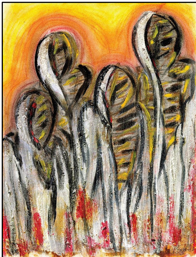
Rubble by Carmelle Beaugelin Inspired by Ezekiel 37:1-14

5 th Sunday in Lent March 26, 2023 at 9:30 AM