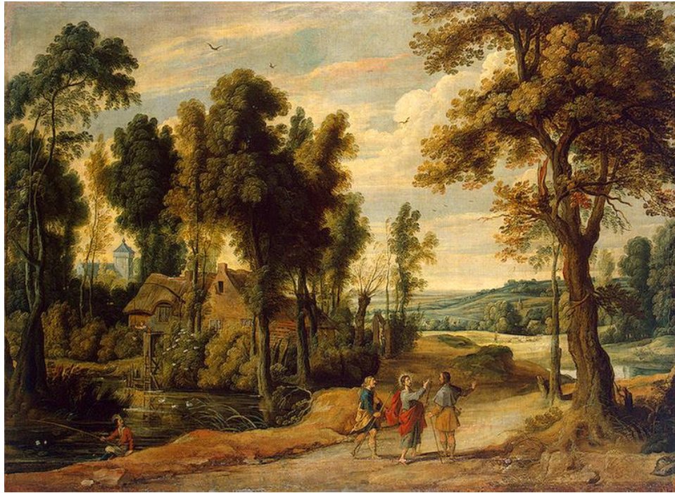
Christ and His Disciples on the Road to Emmaus Jan Wildens (1585-1653) | Hermitage Museum, St. Petersburg

A congregation of the Presbyterian Church (U.S.A)