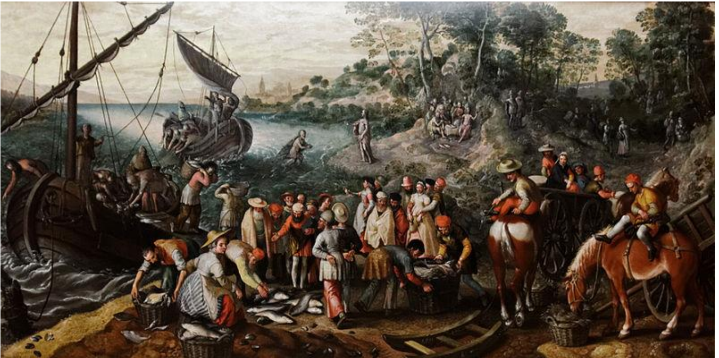
Miraculous Drought of Fishes (1563), Joachim Beuckelaer (1533-1574) | The Getty Center, Los Angeles

17th Sunday After Pentecost September 24, 2023 at 9:30 AM