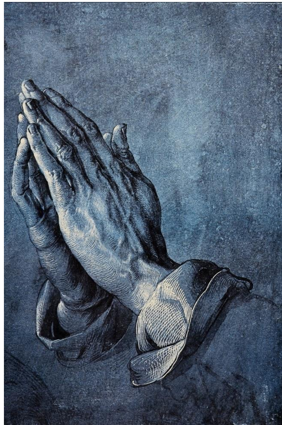
Albrecht Dürer (1471-1528), Study of the Hands of an Apostle (1508-1512) Albertina Museum, Vienna

25 th Sunday after Pentecost November 19, 2023 at 9:30 AM