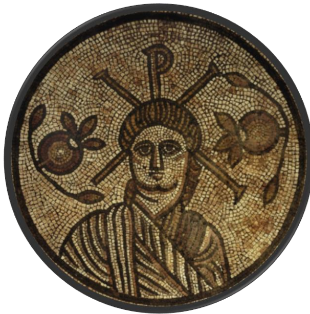
Hinton St Mary Mosaic Oldest known depiction of Jesus Christ in the Roman Empire Hinton St Mary Mosaic - Wikipedia

Reign of Christ Sunday November 26, 2023 at 9:30 AM