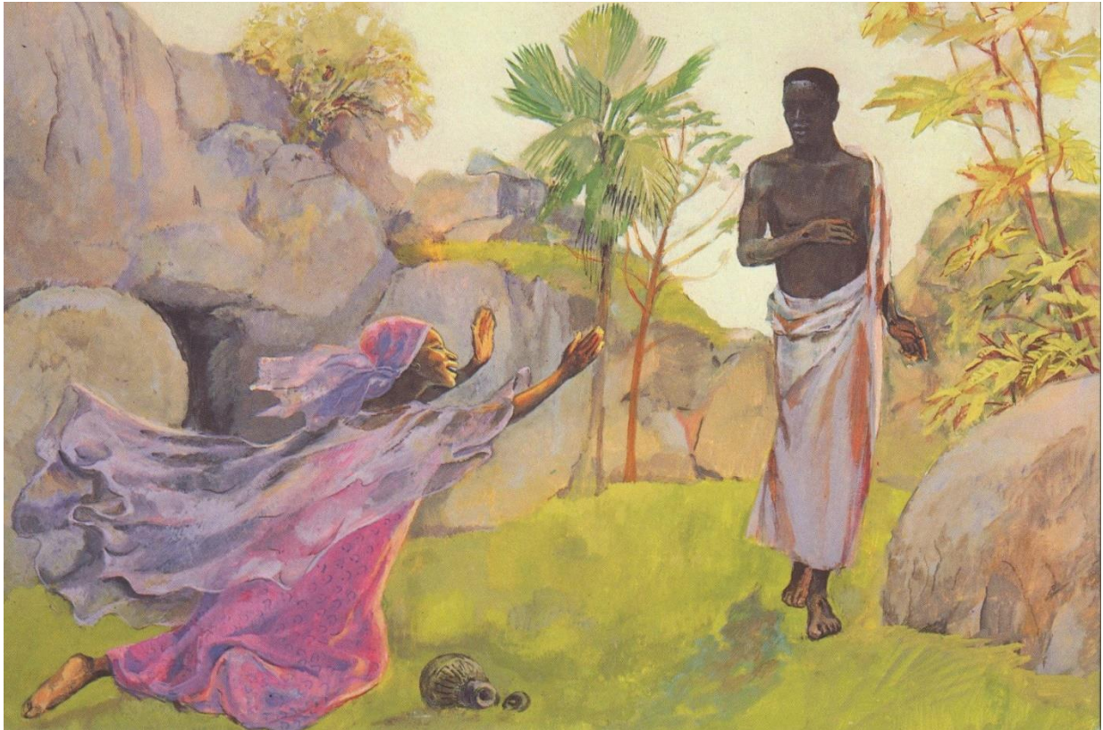
JESUS MAFA. Easter - Christ appears to Mary

A congregation of the Presbyterian Church (U.S.A)